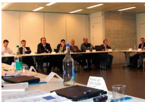
Interested attendees of the Innovation Workshop in Yverdon

After an opening dinner, a day full of technical presentations followed. All presentations focussing on products of Advanced Optics, its processing capabilities and sputtering equipment were highly specialized and technical in content. In addition, external experts from the Fraunhofer Institut in Braunschweig and the EADS Astrium spoke