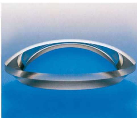
CNC machined Asphere from SCHOTT

SCHOTT is specialized in producing and processing aspheres made of optical glass or fused silica with the Magneto Rheological Finishing (MRF) technology. The utilized process is particularly suited for small to medium series of lenses with diameters between 10–200 mm for laser applications. Thanks to the excellent product quality and reliability, aspheres from SCHOTT are often the component of choice and an increased demand for this product is experienced. In order to serve the market, SCHOTT has bought a new MRF machine, thereby increasing its capacity for CNC-asphere production to deliver higher quantity of lenses to existing and new customers.