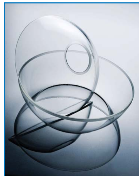
High-precision reflectors offered by SCHOTT

similar vein to this article. The extension of our capabilities and competences underlines our role as your partner for Excellence in Optics. We provide customized solutions for a wide range of applications all over the world.