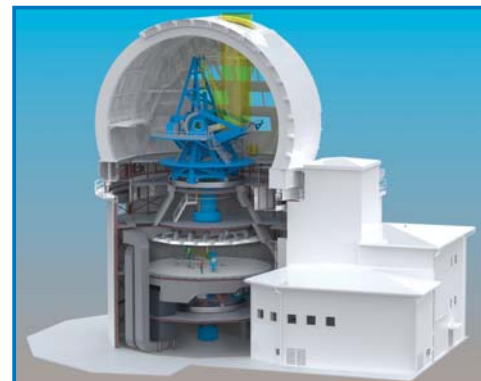
The Advanced Technology Solar Telescope (ATST) is being built on the Hawaiian volcano Haleakalâ ("House of the Sun"). The "first light" is scheduled for 2018.

modern solar observatories currently all feature mirror substrates made from ZERODUR® glass ceramic (Swedish Solar Telescope on La Palma; New Solar Telescope, Big Bear Lake, California; the balloon-carried "Sunrise"; the about to be commissioned German GREGOR telescope on Tenerife).