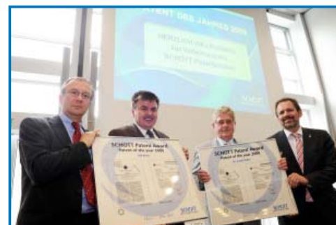
Innovation- and Patent Prize for Advanced Optics

We congratulate our development team and accept these awards as an encouragement to continue with the research work along the entire product portfolio.