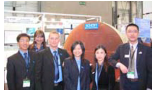
SCHOTT presenting a large ZERODUR® blank at LASER China

For SCHOTT, once again, this year's exhibition was an outstanding platform to maintain existing contacts, to build up new co-operations and to put emphasis on its commitment to the Chinese market. The high quality of contacts and the interest of the media showed that SCHOTT in China, as one of its key markets, has undertaken the right way.