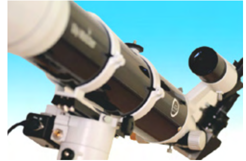
The Telescope, SkyWatcher ED 120, one of the branded products from Synta