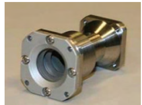
The SwissCube Telescope that will take a picture of the airglow.