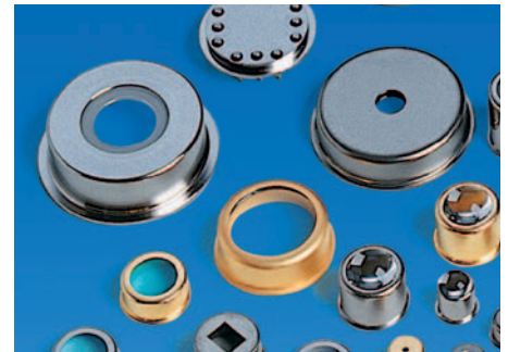
Application: TO Caps

The new N-LaSF46B ball lens has a high refractive index and hence, better coupling efficiency and shorter focal length. These advantages help to reduce the power requirements and overall size of the optical sub-assembly.