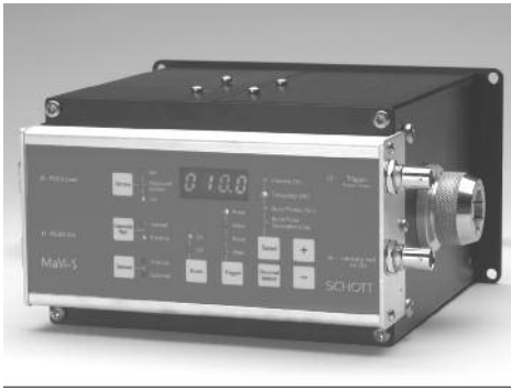
MaVi-S light Source