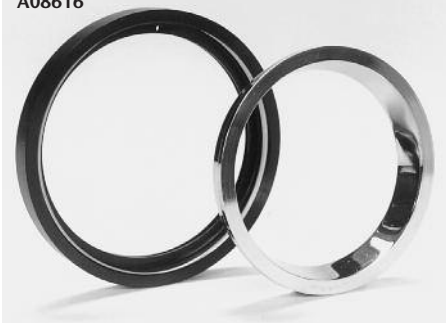
Reflector Ring, A08616