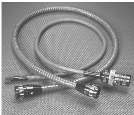
Wound Fiber Bundles