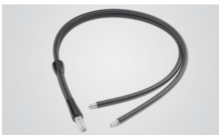
Flexible light guide 2 branch randomized