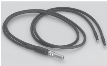
Flexible light guide 2 branch