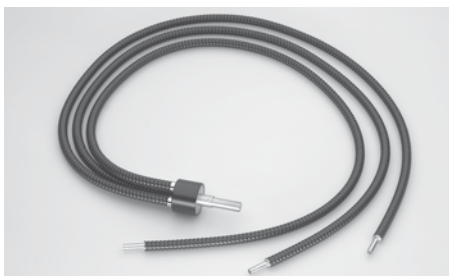
Flexible light guide 3 branch