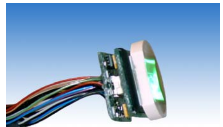
Bonded fiber optic faceplate with a concave radius.