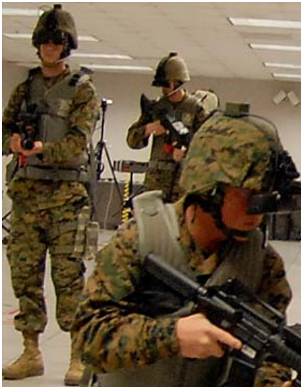
Marines train with the Future Immersive Training Environment (FIME) Joint Capabilities Technology Demonstration (JCTD) Virtual Reality system which operates within Helmet Mounted Display (HMD) technology.

The bonded fiber optic taper - OLED subassembly in SCHOTT's Helmet Mounted Display allows for improved imaging performance at wider fields of view. SCHOTT's unique design incorporates a fiber optic taper with a spherical radius on the output surface to minimize the number of lenses in the eyepiece while maintaining a high fidelity image quality. SCHOTT's assembly process also employs an active alignment process step to precisely align the spherical radius of the fiber optic to the center of the OLED to reduce centering errors in the overall system.