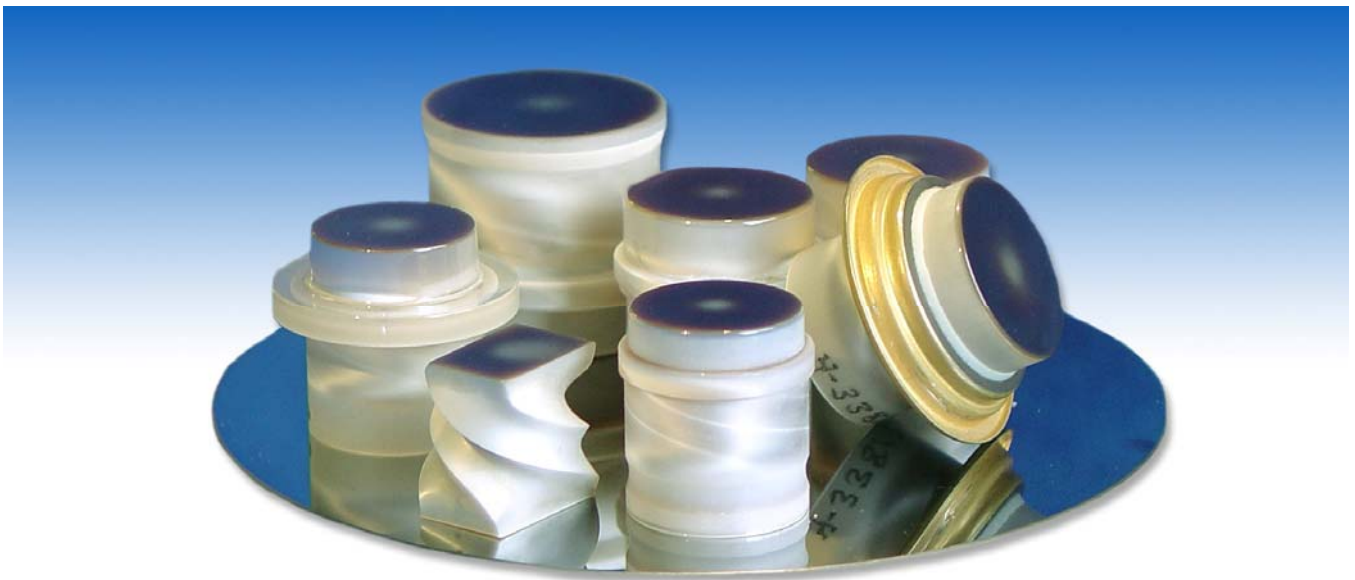
Various fiber optic Inverters machined to different specifications and sizes.

** Resolution Measurement performed with an 1951 USAF Resolution Target using diffuse white light illumination. Resolution may vary with other wavelengths.