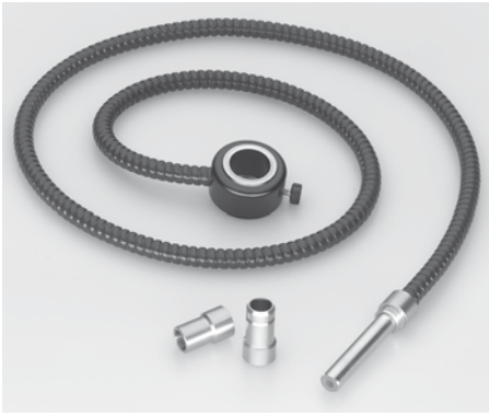
Annular mini ringlight