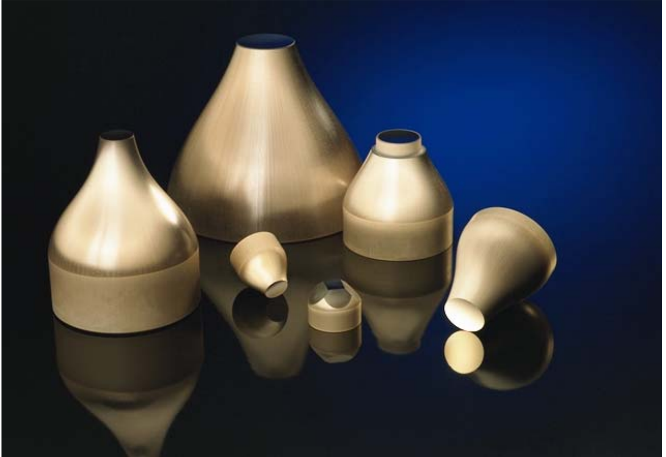
Image Minification or Magnification