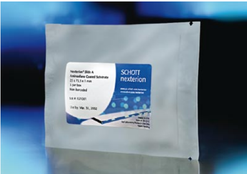
Laminated foil pouch with an inert atmosphere to provide a protective environment