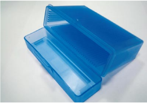
Box for 5 MTP plates or 30 slides