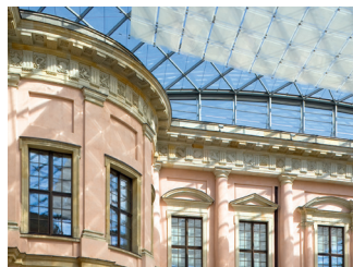
German Historical Museum, Berlin, Germany

GOETHEGLAS is a colorless, drawn glass with the distinctive, irregular window glass surface typical of the 18th and 19th centuries.