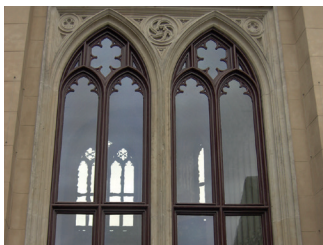
Babelsberg Palace, Babelsberg, Germany