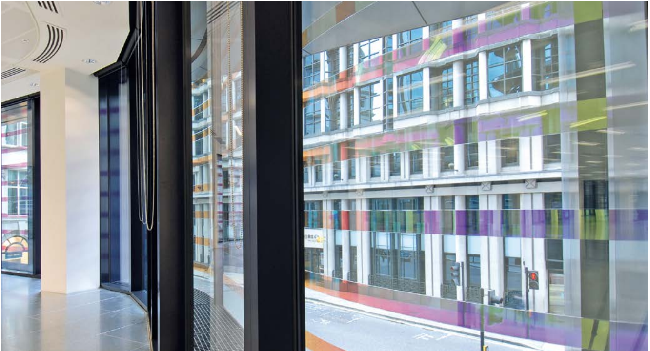
Fascinating view: NARIMA® used in the “60 Threadneedle Street” office building in London Architect: Eric Parry Architects