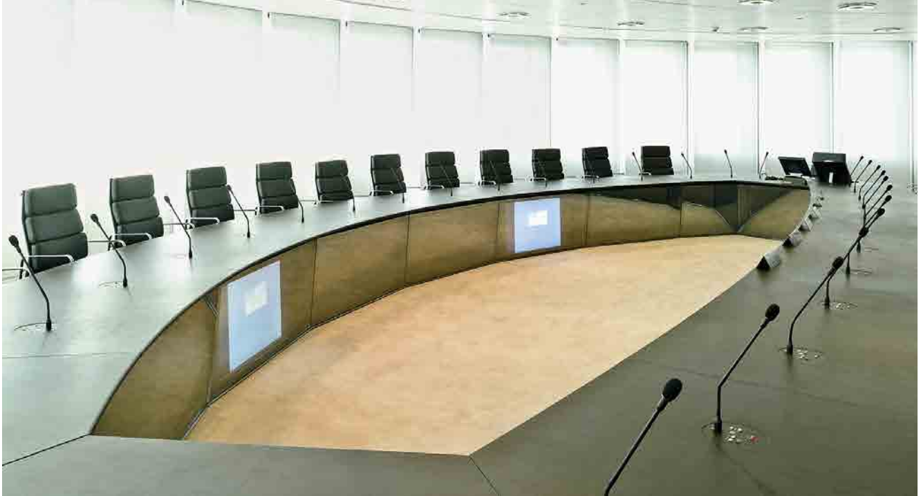
MIRONA® in a conference room at BMW AG