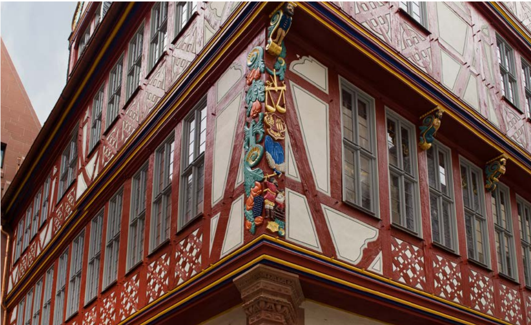
“Goldene Waage” building, Frankfurt am Main, Germany

SCHOTT's Glasses for Restoration are the best choice for the faithful restoration of historical buildings from various eras – mimicking the appearance of the original glazing materials – GOETHEGLAS for buildings from the 18th and 19th centuries, RESTOVER® glass for buildings dating from the early 1900s and TIKANA® glass for buildings from the classical modern period – these glasses also meet any number of contemporary needs because of the wide variety of processing options available, from UV protection to thermal insulation.