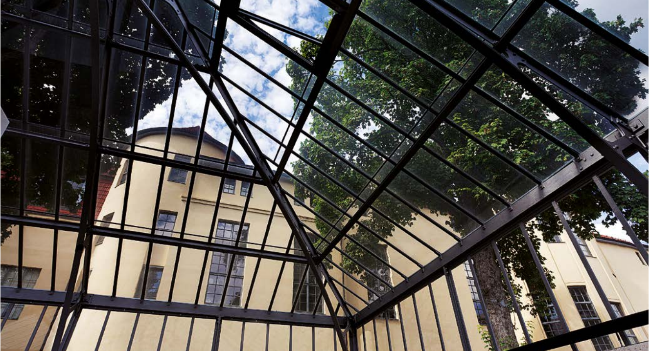
Bauhaus-University Weimar – The Brendel Studio using SCHOTT RESTOVER® laminated glass.