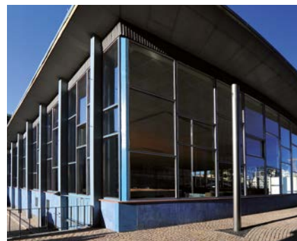
Palace of Tears, Berlin, Germany