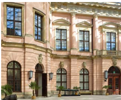
German Historical Museum, Berlin, Germany