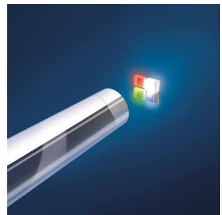
Colorful and Homogeneous