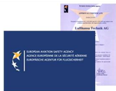
EASA approved STC for installation of HelioJet (white) in A319-A320-A321

All specifications are subject to change without prior notice. This datasheet or any extracts thereof may only be used in other publications with express permission of SCHOTT. © SCHOTT North America, Inc.