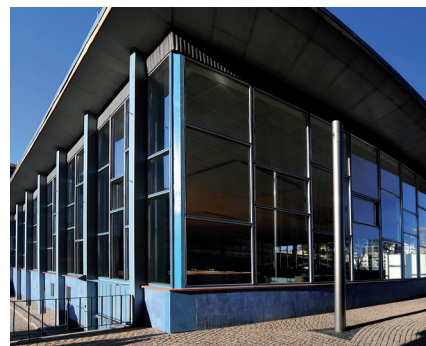
Palace of Tears, Berlin, Germany