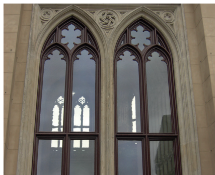
Babelsberg Palace, Babelsberg, Germany