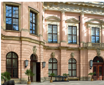
German Historical Museum, Berlin, Germany