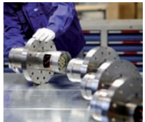
Measurement of glass-to-metal sealed penetrations for PWR and BWR