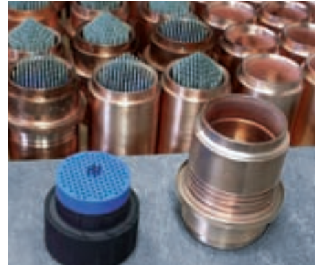
Assembly of Control and Instrumentation (C&I) penetrations for nuclear power plants prior to sealing.