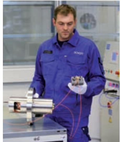
Measurement of glass-to-metal sealed penetrations for PWR and BWR

Phone: +1 508 765-3370 Fax: +1 508 765-3377 epackaging@us.schott.com www.us.schott.com/epackaging