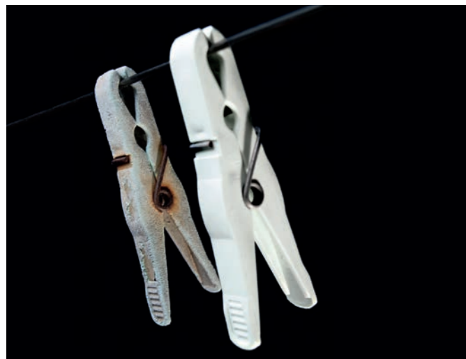
Polymer ages naturally

The sealing must remain leak-tight over years to maintain the safety level, even when exposed to radiation, humidity and fluctuating temperatures. Organic materials naturally age and thus their sealing performance deteriorates over time, especially in harsh environments.