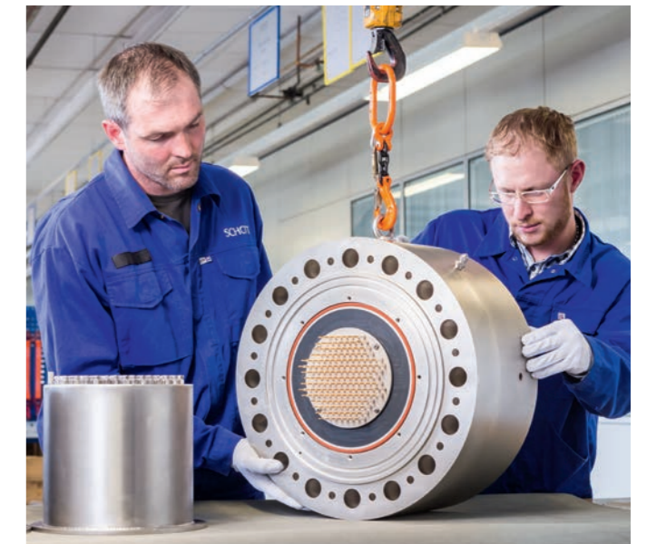
100% Quality Assurance