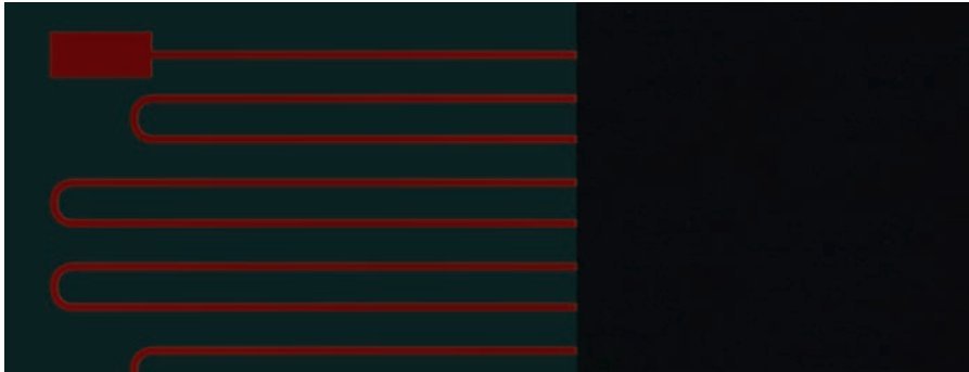
Left: visible printed heating circuit