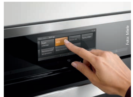
Display area can easily be integrated within a printed glass surface