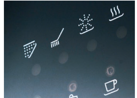
Symbols for indicating the functional status of an appliance