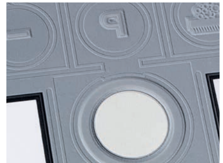
Circuits printed directly onto glass for easy connection to electronic components