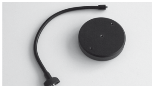
Holding arm for spot light and base stand