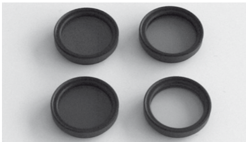
Color filters for spot light