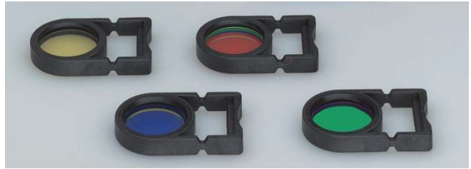
Insert filters for discontinued KL 1500 LCD and KL 1500 compact