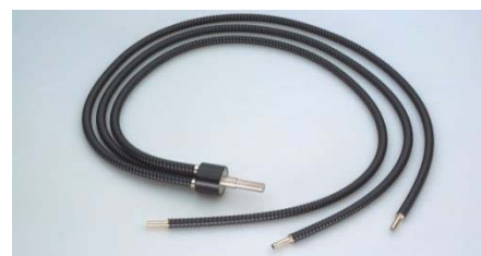
Flexible light guide 3 branch