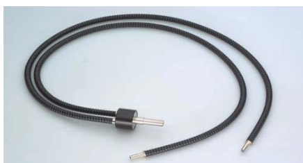
Flexible light guide 2 branch