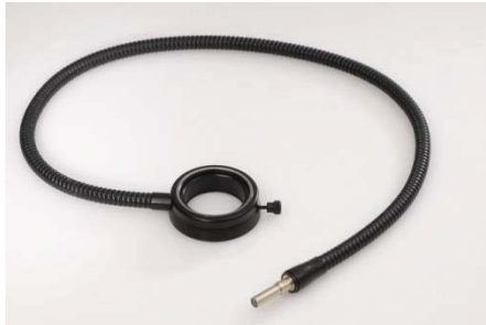
Annular ringlight 58 mm