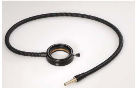
Annular ringlight 66 mm