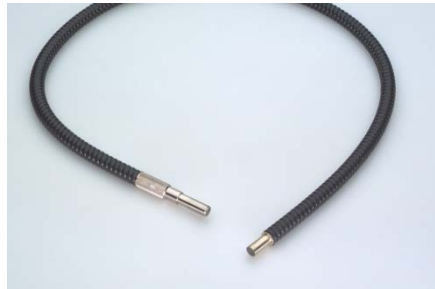
Flexible light guide single