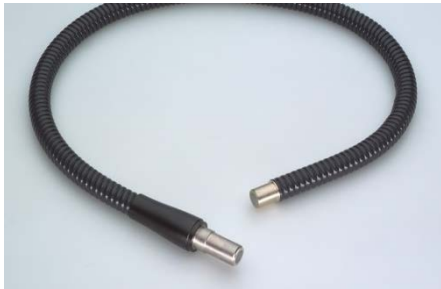
Flexible light guide for KL 2500 LCD