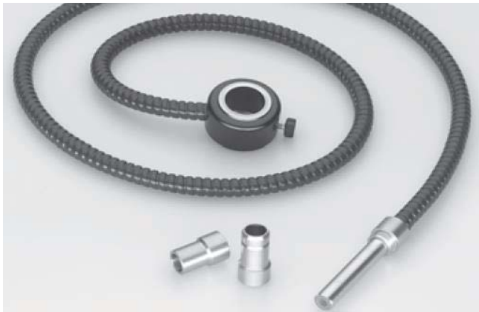
Annular mini Ringlight