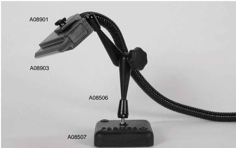
3" Lightline, A08903, with Holder, A08901, supported by an articulated arm, A08506, and base, A08507

For accurate positioning in both industrial and laboratory environments.