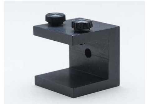
Lightline Holder, A08901