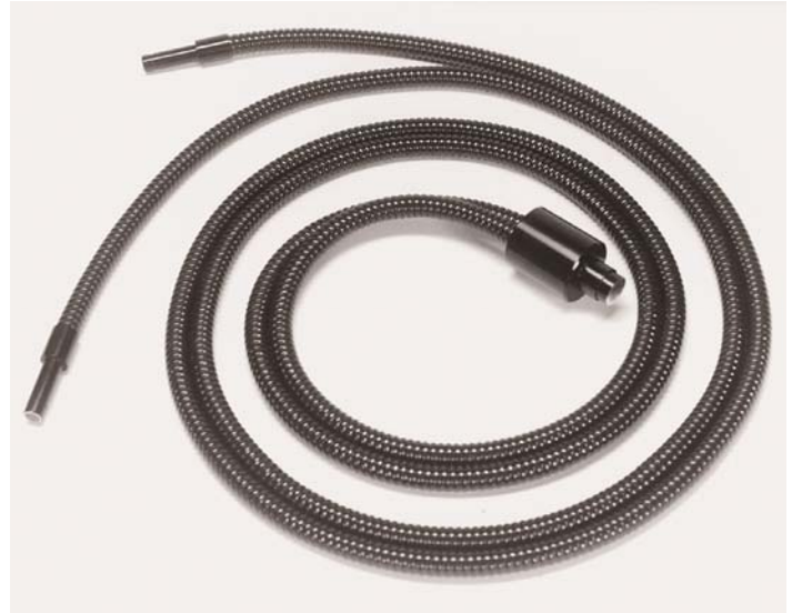
Dual Bundle, A08550.72

Bundle Input: Black Anodized Aluminium Bundle Sheathing: PVC Covered Metal Tubing