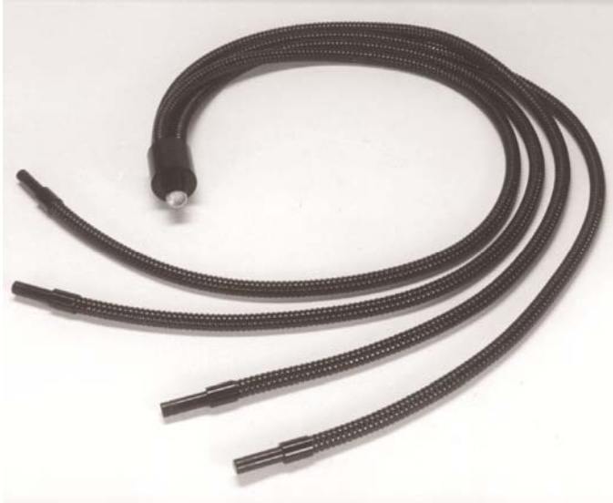
Quad Bundle, A08545

Flexible bundles give the user versatility when routing and positioning light.