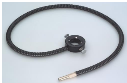
4-point ringlight 30 mm