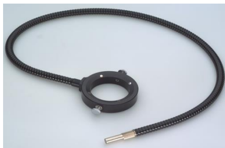
4-point ringlight 66 mm