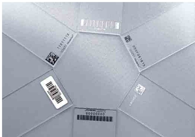
Barcodes and logos on NEXTERION® substrates

SCHOTT can offer customers the opportunity to customize their slides and glass substrates with graphics, logos, company names, barcodes, reference marks, or 2-D matrix codes. These markings may be added at any location on, or within the glass surface, and may feature a combination of items, for example a company logo plus a sequential barcode.