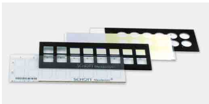
Different patterning, coatings and marks on NEXTERION® substrates

SCHOTT Microarray Solutions is also able to coat glass substrates with coating chemistries developed by clients.