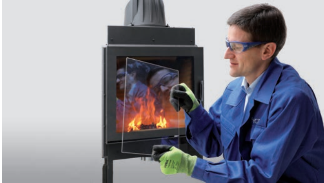
Fire viewing panels with heat-reflective coating IR Max