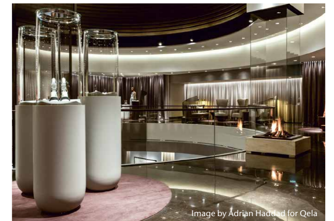
Product presentation: Qela Store, Qatar