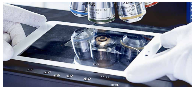
Xensation® Cover stands for a pristine, display grade cover glass with a clear, elegant visual quality.

Xensation® Cover is a chemically strengthened alumino-silicate glass that offers an outstanding level of mechanical impact and bending strength, as well as high resistance to scratches. This specialty glass has been designed to achieve strength performance levels ideally suited to tough applications – from smartphone to rugged displays to automotive applications to safety glazing. The unique glass composition combined with more than 130 years' experience in making specialty glass results in one of the most robust and reliable cover glasses available today.