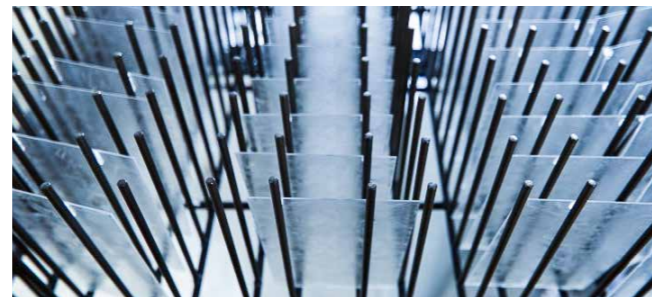
Xensation® is easy to process and strengthen according to accepted industry standards.