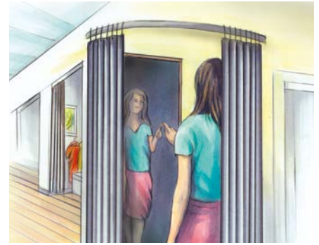
Strong light in the changing room: SCHOTT MIRONA® is an elegant silver shimmering mirror – despite a reflectance of only 34%.

Are these trousers available in a smaller size? Is this top available in other colours? Which jacket can I combine the jeans I'm just trying on with? The digital sales-assistant is there to answer these questions. And if a product is not in stock, it can be ordered directly via touch display and delivered either to the shop or a customer's home address. The ideal way to combine the strengths of physical retail with the comfort of online shopping.