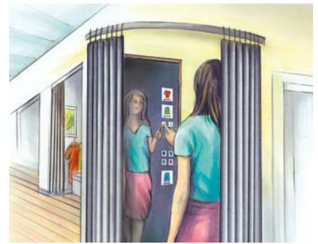
Lighter surroundings behind the glass pane: The display becomes visible and usable.